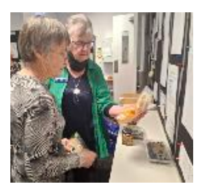
Kay advised on healthy option